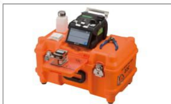
Carrying case with worktable CC-82

Items listed in the table are typical contents included with the splicer body. Overall kit content may vary regionally. Please check with your local authorised reseller to confirm kit content in your region.