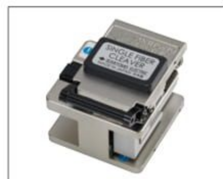
Table-top cleaver SFC-S